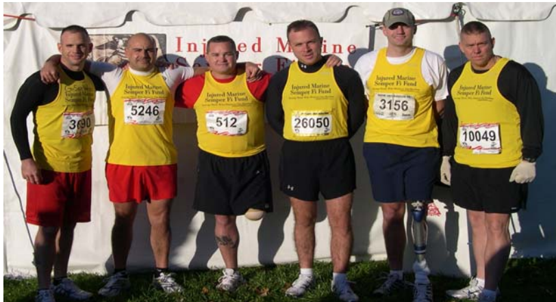
Runners from our Injured Marine Semper Fi Fund team

October 29, 2006 was the 31 st running of the Marine Corps Marathon. The Injured Marine Semper Fi Fund fielded a team of 155 runners, three of whom had been injured in Iraq. The race started near the Arlington Cemetery and wound its way through Washington, DC, finishing at the Iwo Jima Memorial.